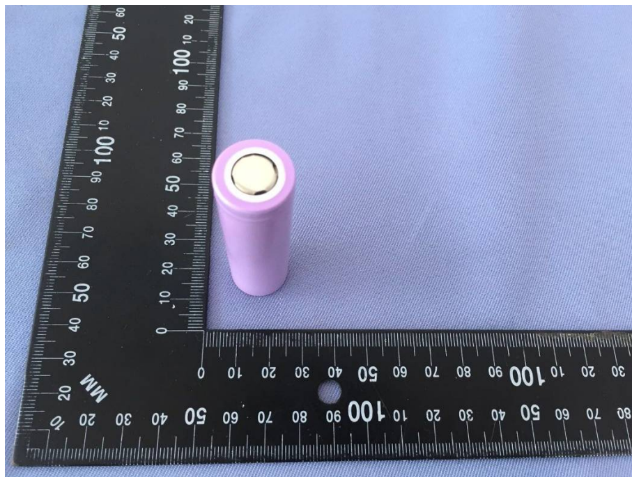
Figure 2 General view 1 of cell